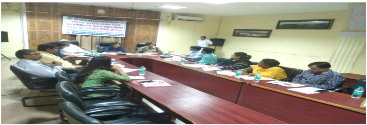
Effective implementation and awareness of PCPNDT Act under Beti Bachao Beti Padhao.