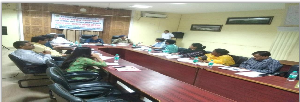
Effective implementation and awareness of PCPNDT Act under Beti Bachao Beti Padhao.