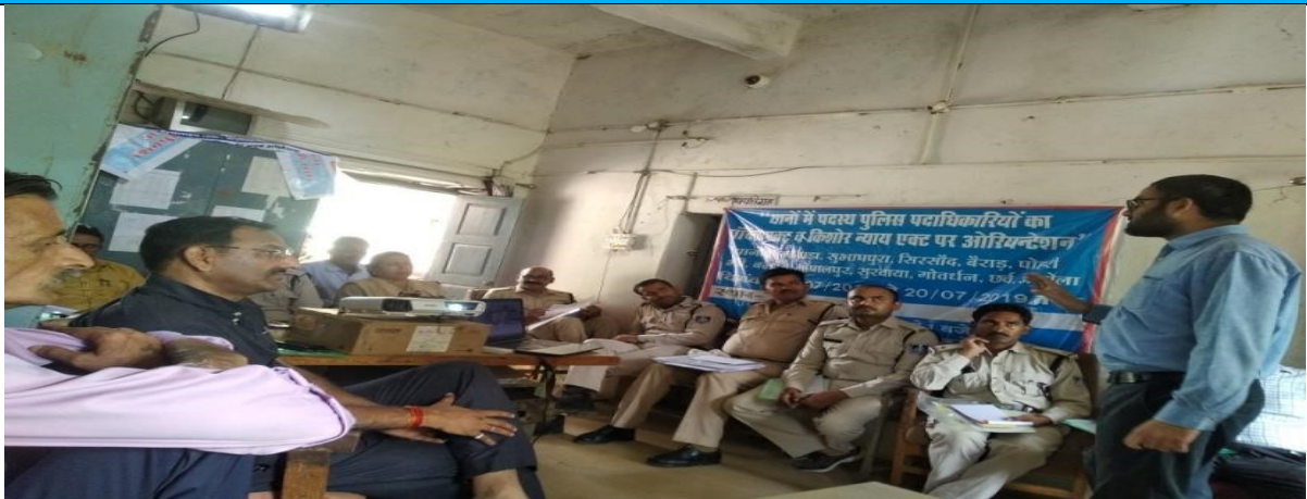
Important discussion with Police dept. of Shivpuri on POCSO and JJ Act