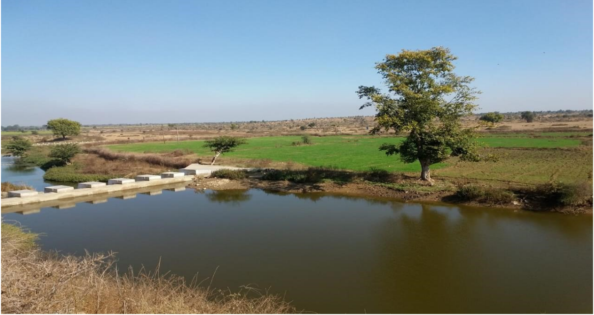
Stop Dam Constructed Under BRLF EU program at Kalothara village