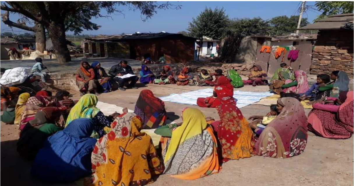
Meeting with Self-help group women's at village Khutela