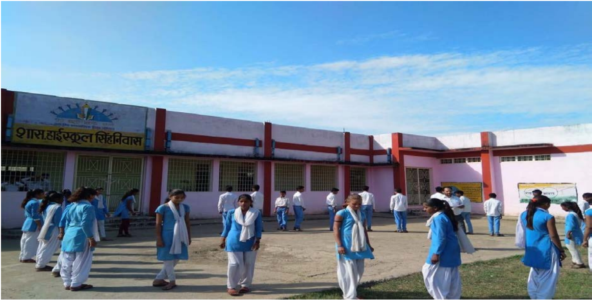
Awareness Activity with adolescent at village Singniwas